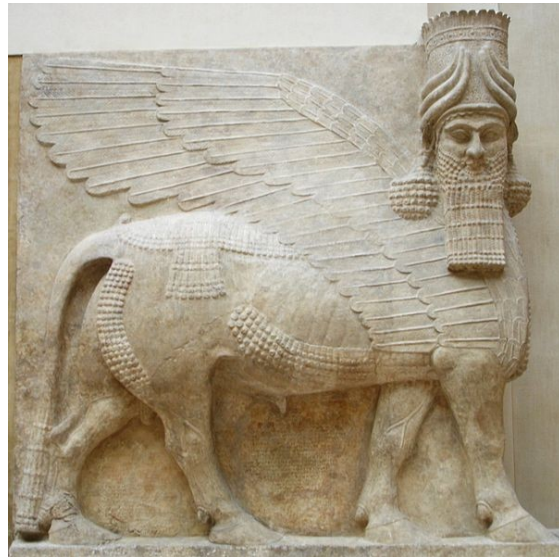
Civ Emblem: Star of Shamash (or Winged Bull?)